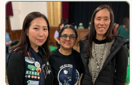
Girl Scouts Appreciation Award